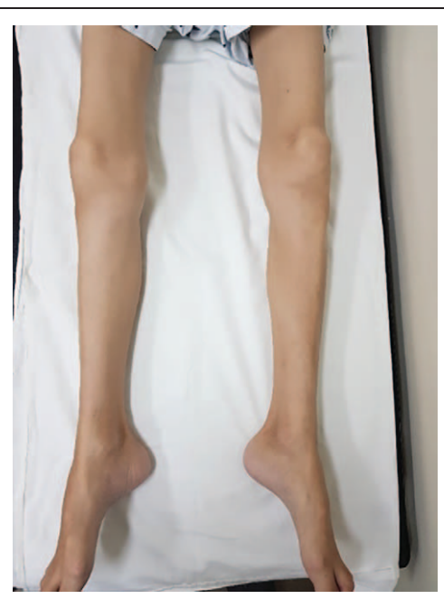
Figure 1. Atrophic changes were observed in both lower limbs.

A physical examination revealed that her cranial nerves were intact. Vision was normal, and pupil was 3 mm isocoric and reactive to light. Ocular movement, hearing, and tongue movements were normal. Facial sensation and symmetry were intact, but severe dysarthria and dysphagia were observed. According to the Medical Research Council (MRC) grade, the muscle strengths of bilateral upper extremities were 2/5 in proximal and 3/5 in distal muscles. The muscle strengths of bilateral lower extremities were 2/5 in both proximal and distal muscles. Deep tendon reflex test revealed increased biceps and triceps jerk, but decreased ankle jerk. She also showed decreased proprioception in bilateral lower extremities. A cerebellar examination showed bilateral abnormal findings in finger-tonose and rapid alternative movement tests. Bilateral limb and truncal ataxia were observed as well. BMI was 14.45 kg/m<sup>2</sup>, and severe malnutrition was suspected (Fig. 1). She had difficulty in voiding and so a Foley catheter was inserted.