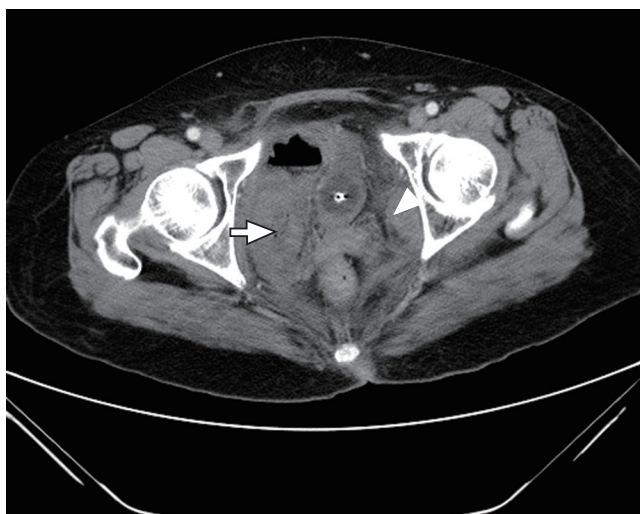
Fig. 1. Abdominal and pelvic computed tomography scans. The patient had 100×46 mm sized peritoneal abscess (arrow) and 38×23 mm sized abscess in the left internal obturator muscle (arrow head), accompanied by gas-forming bacterial infections.

ture test, gram positive Streptococcus constellatus was identified. On day 14, the patient had a drain removed before discharge. Two months thereafter, the patient achieved spontaneous closure of the incision site on the anterior vaginal wall, and showed no recurrent episodes.