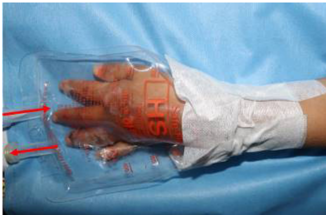
Fig. 3. The image of topical oxygen therapy. Wound was sealed with aseptic fluid bag which can be connected with an oxygen cannula. The fluid bag expanded in balance with the external pressure of 1 atmosphere.