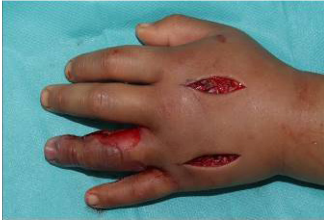
Fig. 2. Intraoperative finding. Fasciotomy and negative pressure wound therapy was performed.