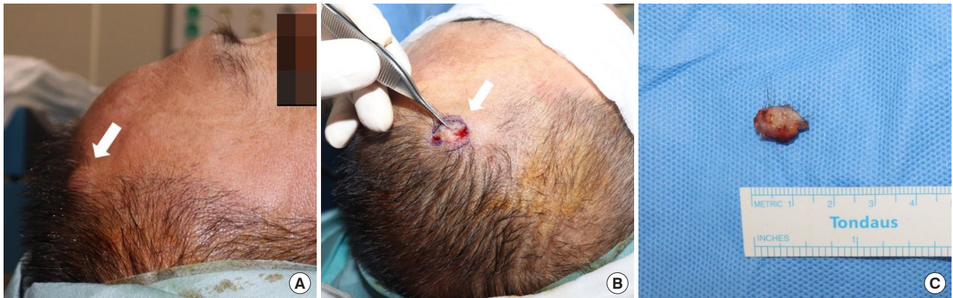
Fig. 1. A 1 cm-sized nodule (white arrow) attached to the frontalis muscle. (A) Preoperative photograph. (B) Intraoperative photograph. (C) Photograph of the specimen.

the temporal scalp just above the hairline (Fig. 1A). The suspected diagnoses included epidermal cyst, lipoma, or other benign neoplasms, and a further differential diagnosis was deemed necessary. Excision and biopsy were performed for an accurate diagnosis and treatment. The incision line was designed with a 5-mm free margin from the mass. After dissecting the skin and soft tissue, an irregularly shaped mass with heterogeneous high vascularity attached to the frontalis muscle was observed (Fig. 1B and C). The mass was completely removed without any remnant tissue, and the skin was sutured. Microscopic findings of the scalp mass revealed tubular structures lined by mucin-secreting columnar epithelium in the dermis, consistent with metastatic adenocarcinoma (Fig. 2).